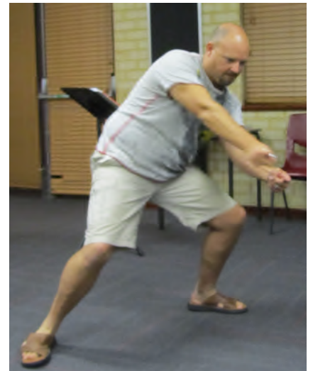
A snail is wrangled ...