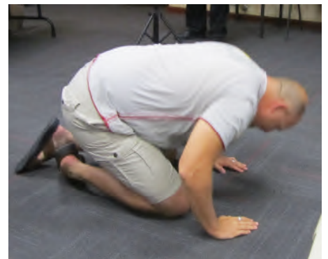
...to the floor