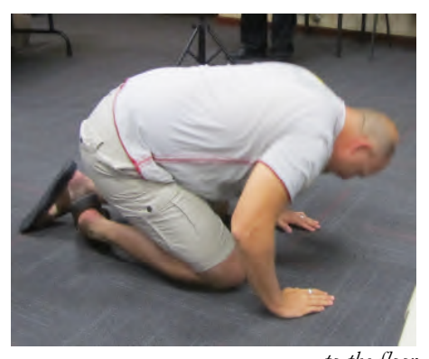
...to the floor