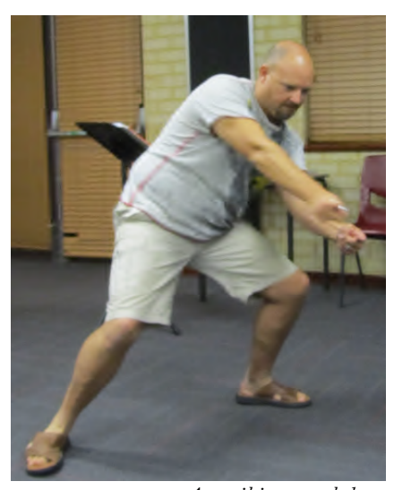
A snail is wrangled ...