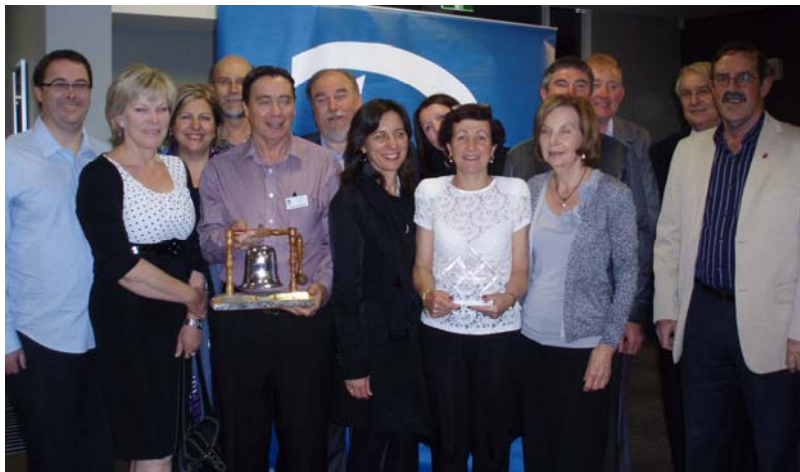
Jubilant Club 15 members with their R. Alan Crook Award

In the club awards, Club 15 won the R. Alan Crook club of excellence award for a record sixth time, and Club 52 from Mandurah won the David Price Award for club of excellence in the country.